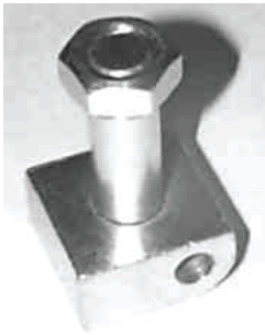
Stay Pole Tilt Pin (Comes with nut)