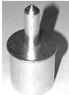
Stay Pole Spike