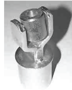
Stay Pole Top