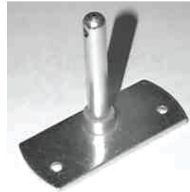
Stay Pole Mount Pin (includes Hitch Pin & Chain)