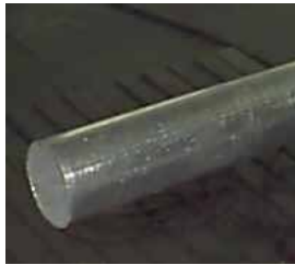
Stay Pole Tubing 2" I.D.